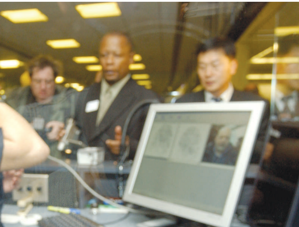
US security measures have left many foreign scientists tied up in red tape.

contributed to a less impressive, but still positive, 1% rise in admissions to PhD programmes in the life sciences and a 5% rise in physical sciences. Final enrolment numbers out later this year are expected also to show a positive trend, says Stewart. "We're seeing a turnaround."