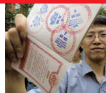
US VISAS IN FOCUS Nature's collection of news on immigration controls. www.nature.com/news/infocus